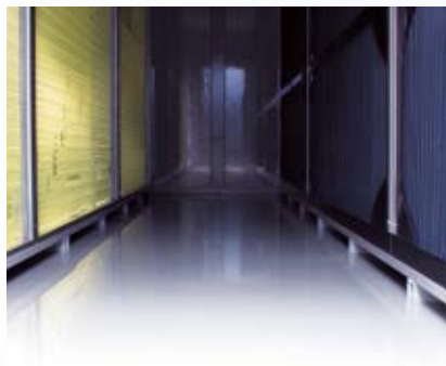
Completely accessible drain pan under cooling coil can be fully and easily cleaned.