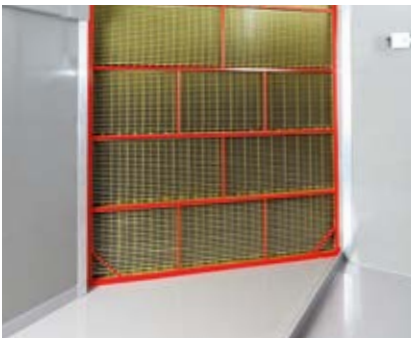
Corrosion protected plate heat exchanger (on demand) with epoxy coated drip tray.