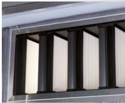
Front withdrawable compact filters on customer request.