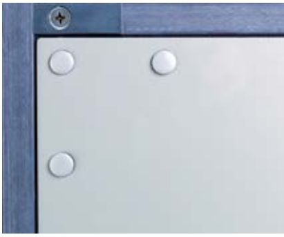
Weatherproof and UV-resistant casing, consisting of a composite frame construction and fibre reinforced panels with gel-coat top layer.