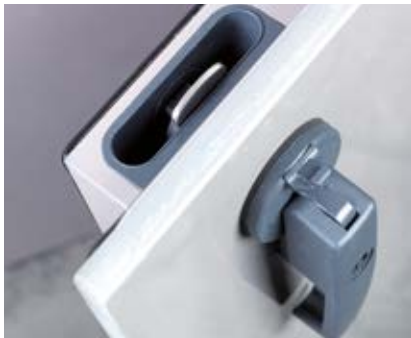
Cold bridge free locks, concealed in the panel with overpressure protection and key operation (VDI 3803 guideline).