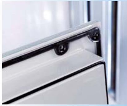
Fully closed vapour tight panel with durable double sealing, prevents penetration of moisture (VDI 6022 guideline).