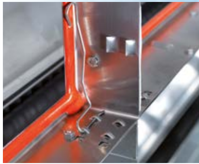
Filter frames (stainless steel -AISI 316- and galvanised) with durable, water-repellent sealing (VDI 6022 & VDI 3803 guideline). Filter frames suitable for filter types up to filter class F9 (EN 1886).